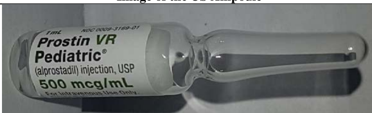
Image of the US Ampoule